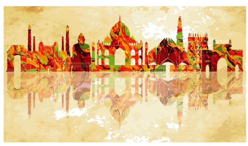
India eyes doubling of foreign tourists to 20 million by 2020

Mumbai: India, which saw a record number of Foreign Tourist Arrivals (FTA) of 10 million in 2017, is targeting to double this number in next three years, Minister of State Tourism KJ Alphons today said.