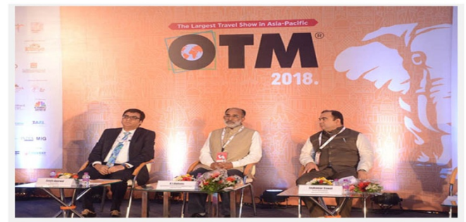
al, Chairman and CEO, Fairfest Media Limited, Shri. K. J. Alpl overnment of India, & Jaykumar Rawal, Minister of Tourism, Sanjiv Agarv Tourism, G ns, Minister of State (I/C) overnment of Maharashtr

backwaters in the South. Indian tourism also offers spiritual tourism and cultural heritage with its widely spread civilisation in the sub-continent. I am grateful to the Government of India and Prime Minister Narendra Modi for their effective efforts, regular outreach to the world community and the Indian Diaspora, which has positively changed the outlook of India for tourism in the country. The Ministry of Tourism is working to bring in confidence building mechanisms to establish India as a peaceful and safe destination," he further added