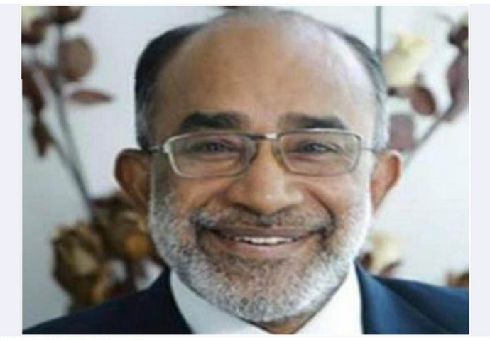
Tourism Minister Alphons Kannanthanam

MUMBAI, JAN 18: India, which saw a record number of Foreign Tourist Arrivals (FTA) of 10 million in 2017, is targeting to double this number in next three years, Minister of State Tourism KJ Alphons today said.