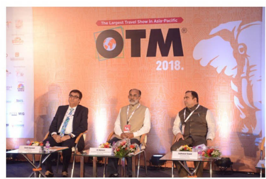
OTM, the largest travel trade show in the Asia Pacific region, began yesterday. The three day event is being held at Bombay Exhibition Centre in Mumbai. The event was inaugurated in the presence of Shri. K J Alphons, Minister of State for Tourism (J/C), Government of India and Shri. Jaykumar Rawal, Minister of Tourism, Government of Maharashtra.

APAC's largest travel trade show OTM begins in Mumbai